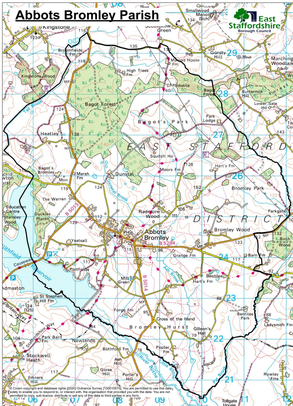
Figure 1 - Abbots Bromley Neighbourhood Area