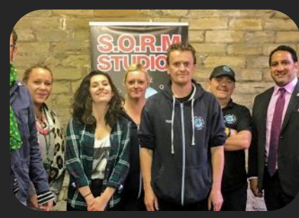
Venue / Festival