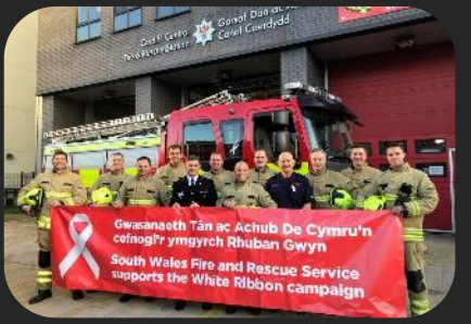
Fire & Rescue