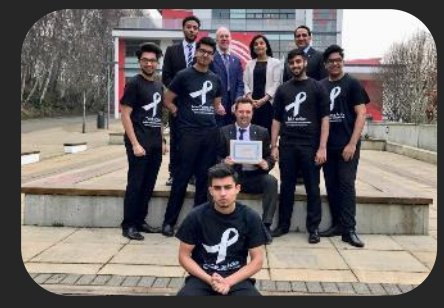
College / University