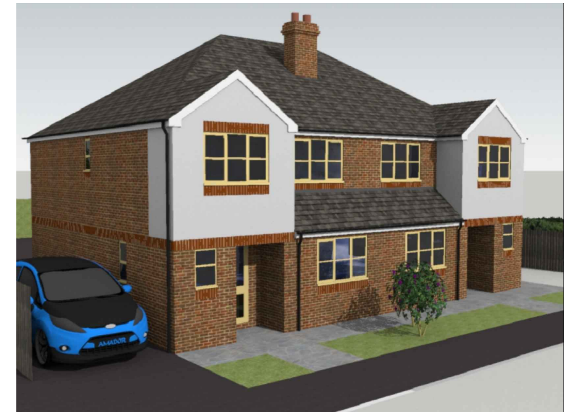
Typical Artistic Impression